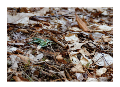
Dead Organic Matter

<u>Eaten by</u>: Elk, deer mice, yellow-bellied marmots